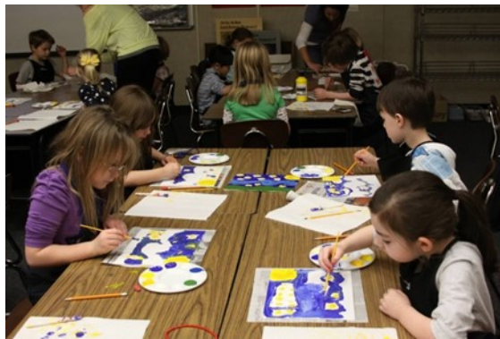
If you can use scissors, you've got what it takes!

The program is powered 100% by Mary Woodward parents, and is generously funded by the PSO. In order to have a successful program, we need your help!