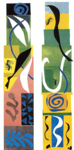
Les Bêtes de la mer... H. Matisse 50

It’s never too late to sign up to help with Art Lit! Helping hands are always appreciated. Please contact artlit chairs@gmail.com for more information.