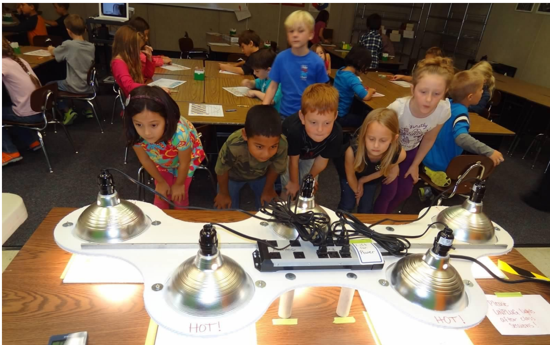
Students working on art inspired by Ansel Adams